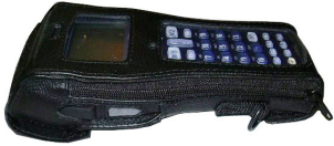
BHT300Q 2D Leather case D-Rings, zips Product ID: 0000-0775 Further details on Page 4