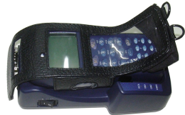
(Dockable) BHT8000 Leather case D-Rings, PVC keyboard cover Product ID: 0000-0780 Further details on Page 7