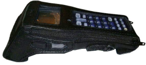
BHT 300B Leather case D-Rings, zips Product ID: 0000-0773 Further details on Page 2

DENSO ADC is among the world's largest manufacturers of mobile data capture systems. The company, which pioneered CCD technology and invented the revolutionary QR Code®, offers a wide range of advanced-technology, including handheld 1D and 2D terminals and scanners, featuring lightweight, yet durable, ergonomic designs.