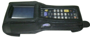
BHT400 Padded Leather case PVC keyboard cover Product ID: 0000-0778 Further details on Page 6